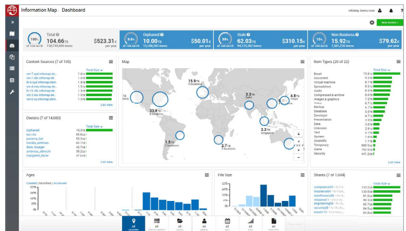
Figure 3. Veritas Information Map integration renders your information environment in visual context and guides users towards unbiased, information-governance decision making.

Backup Exec's integration with Veritas™ Information Map renders your information environment in visual context and guides users towards unbiased, information-governance decision making. (See Figure 3.) Using the Information Map's dynamic navigation, customers can identify areas of risk, areas of value and areas of waste across their storage environment and make decisions which help reduce information risk and optimize information storage.